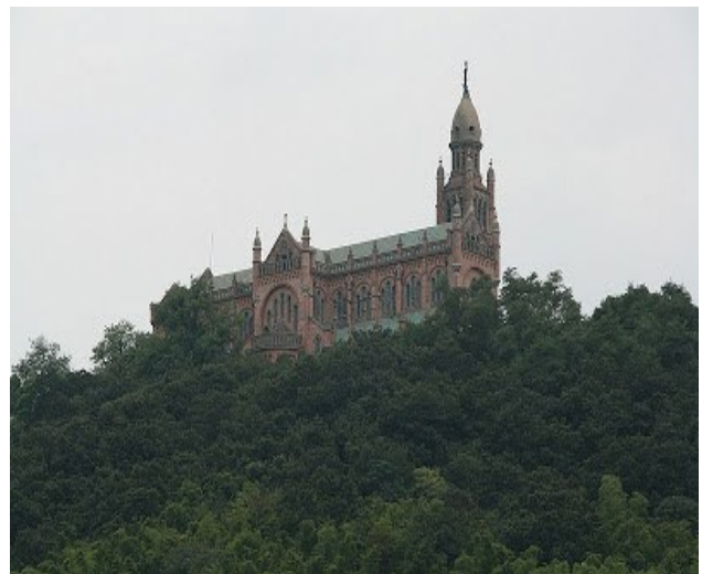
Sheshan Basilica, Shanghai

In the face of all this, the Catholic Diocese of Hong Kong and other Chinese Church communities can continue to play a bridge role with the faithful in mainland China by sharing their knowledge and experience in pastoral work, accompanying them in journeying forward and, in turn, learning from them how to witness to faith with perseverance and fortitude.”