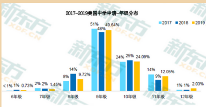
Number of Chinese middle & high school students in US by grade (from 6th grade to 12th grade)

[In Chinese] by XDF-New Oriental The full document https://cutt.ly/QgSOLHm