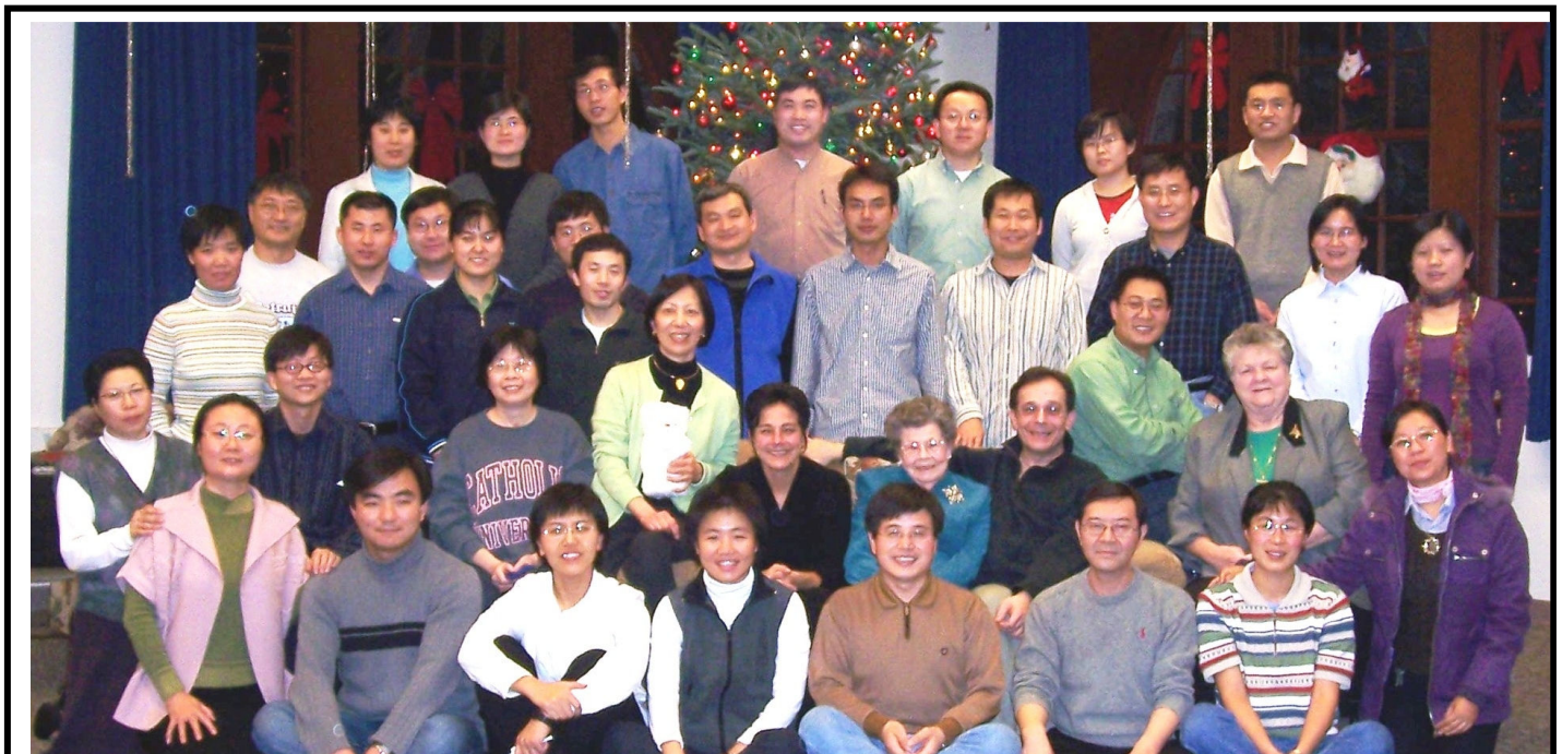
Participants at the Winter 2007 Pastoral Enrichment Seminar

As a complement to their scholastic program while in the USA, young clergy, religious sisters and a few lay women from China attend an annual retreat in summer; and a pastoral seminar over the Christmas-New Year school holiday. This year the seminar theme was "The Artist as Missioner of the Soul and the Senses" – reflecting on how drama, painting, sculpture, film and music remind us of the foundational life-death-resurrection rhythm of human life. Art is an effective medium to contemplate and express Faith. Five artists shared their life experiences, feelings, and love of their craft; from which the participants took inspiration and encouragement to remain strong in their own vocational callings.