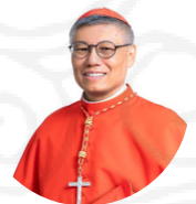
Cardinal Stephen Chow

8:30–9:30 am Sunday Morning Keynote (Rm. 120A)