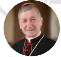
Cardinal Blase Cupich